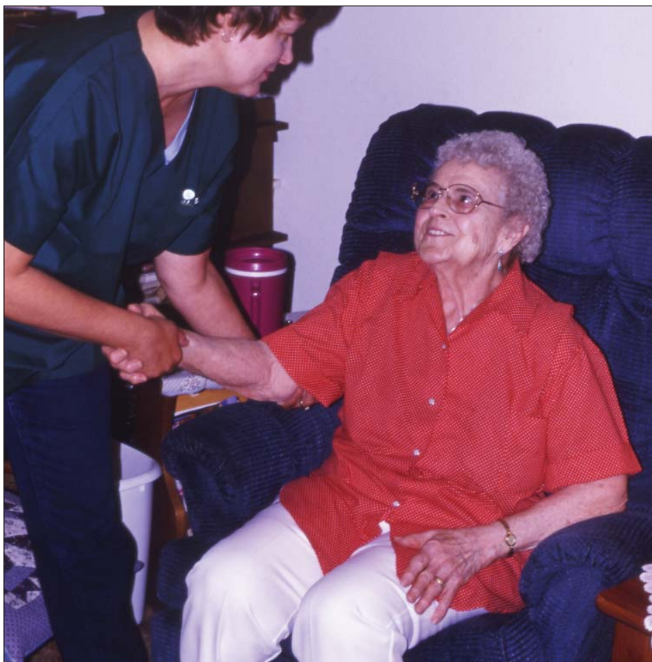
A qualified member of your staff can be an expert witness

The testimony can be used instead of observations by the assessor, for the option units, so this new role may be of benefit to your organisation and you should ask your training provider for more information if you are interested.